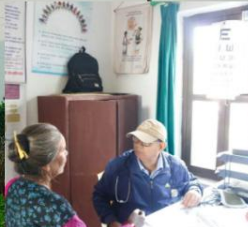
Health Service Providers